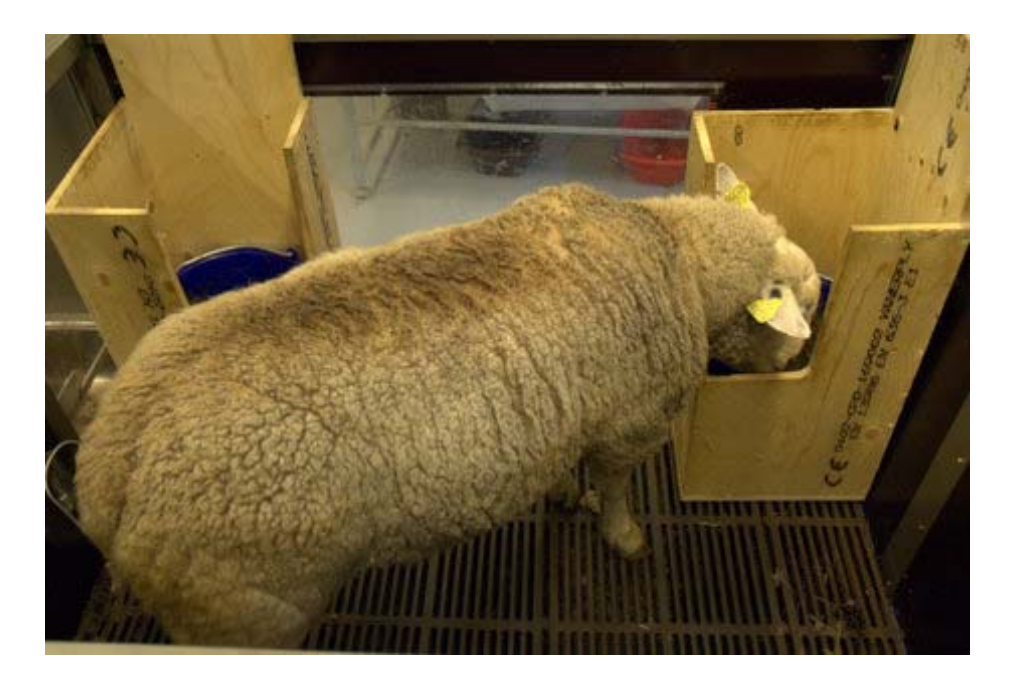
Figure 2.2 Sheep in an extended metabolism pen choosing between clean and contaminated water.

water (drawn just before the day's experiment started and stored in open buckets within the experimental room) to approximately the same level as in the WP-solution bucket. Water had to be added in three instances; the level of contaminated water never had to be replenished.